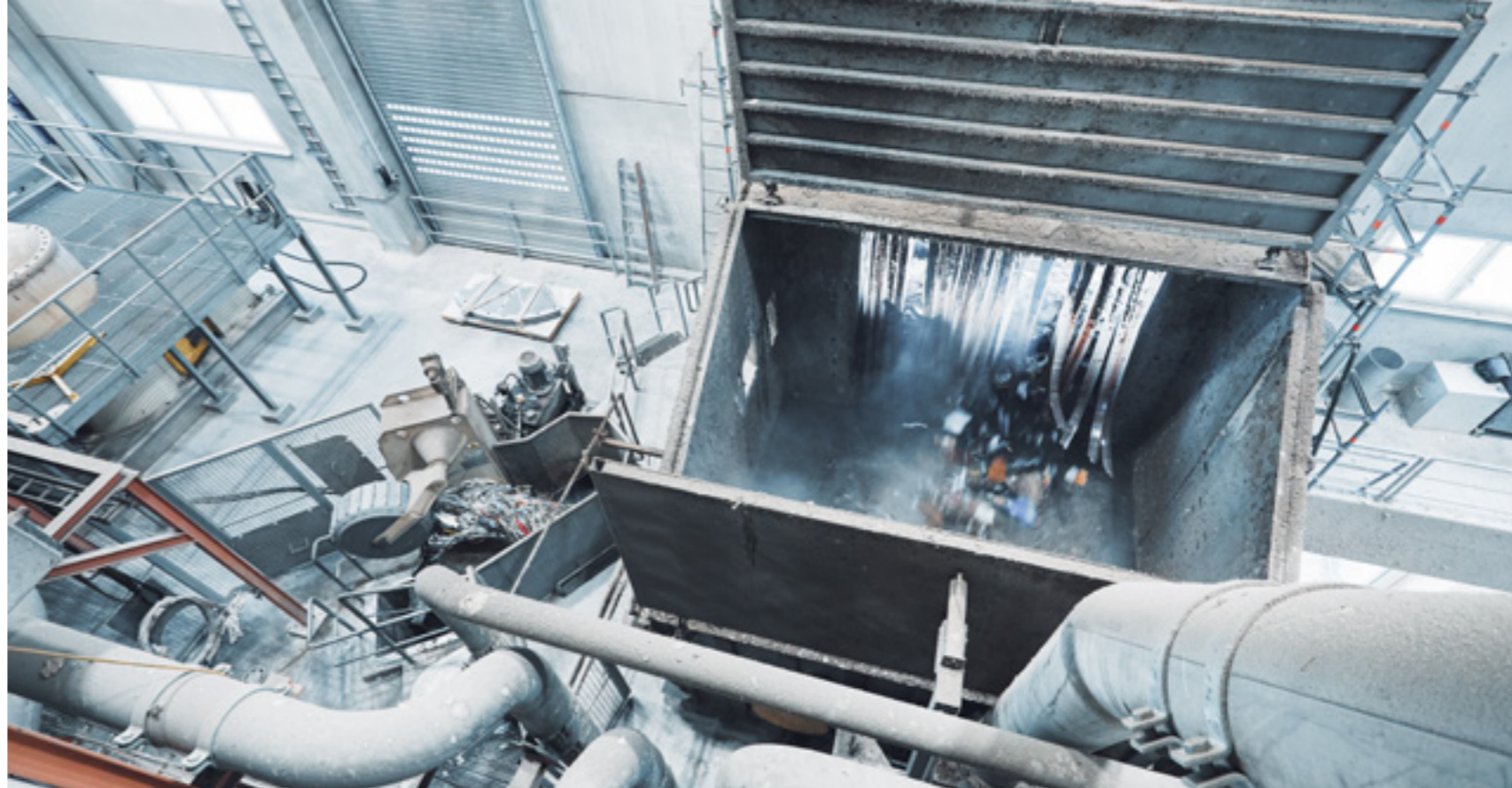
The former grinding facility was converted to an RCF line with a capacity of 1,350 tons per day. An ANDRITZ FibreSolve FSR pulper complete with disposal system ensures optimum pulping of the raw material.

Welt is convinced that production will stabilize at 80 g/m 2 in the first quarter of 2019 and the final capacity of 420,000 tons per year will also be achieved in the first six months of operation. "Then we will prepare in stages for production of 70 g/m 2 as well and with further increases in speed." So the target of 1,400 m/min at this basis weight is already in sight.