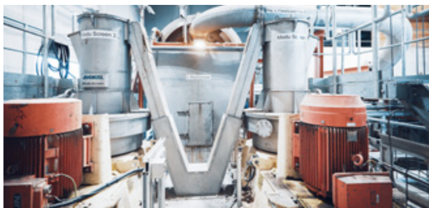
ANDRITZ ModuScreen TD coarse screen as part of the stock preparation plant

"Integration of old and new – that was really successful and is also something special." In his view, this also demonstrates good interface planning. "I have only had experience with greenfield projects so far and saw how overall predictability is quite different in projects like this. I would say that it is more demanding – and more strenuous – than a greenfield plant."